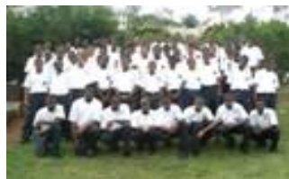
HIGH SCHOOL BOYS

We are inviting you to take your turn in coming from the endless parts of the earth to make your input for whatever period the Holy Spirit will instruct and guide you to serve these potential leaders as special education teachers, youth workers or in whatever capacity God would have you to perform works of service, let us build the body with "the word" and win the lost through evangelism.