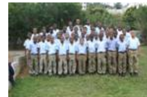
PREP. SCHOOL BOYS

We would very much appreciate your help with this.