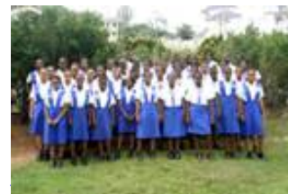
HIGH SCHOOL GIRLS